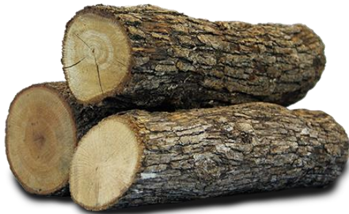
Logs (NPK, soil health) - Long lasting energy, the foundation of a fire