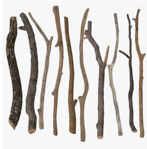
Sticks/Kindling (starter) - Give moderately sustainable energy to the fire